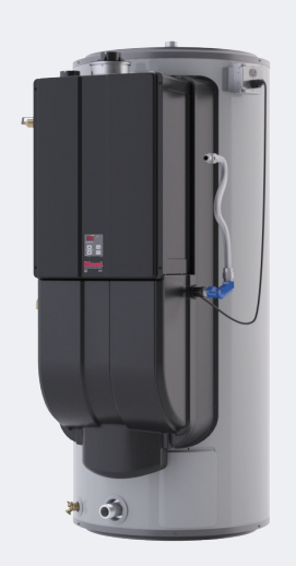
High Efficiency Hybrid Technology. Performance and Reliability Combined