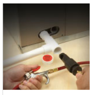
Flexible To Use

The A/C Easy Tee can be installed in many different ways. There is no designated inlet or outlet. Both connections can be either. The Service Tool Kit can be used with water or nitrogen to blow out a condensate drain line. It can also be used with a wet/dry vac to suck dirt, debris and gunk out of a primary drain pan.