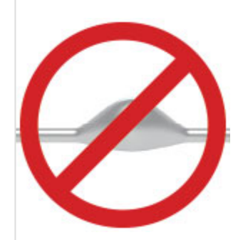
No Drain Blockage

The A/C Easy Tee can be installed in many different ways. There is no designated inlet or outlet. Both connections can be either. The Service Tool Kit can be used with water or nitrogen to blow out a condensate drain line. It can also be used with a wet/dry vac to suck dirt, debris and gunk out of a primary drain pan.