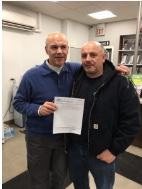
I.B. Heating & Cooling Express - $2,000.00