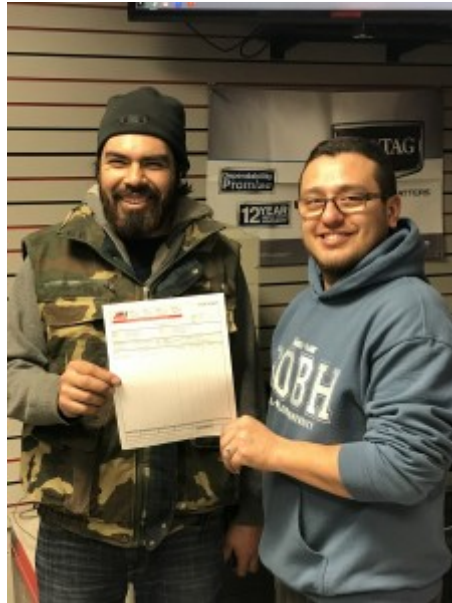
Galindo's Heating - $800.00