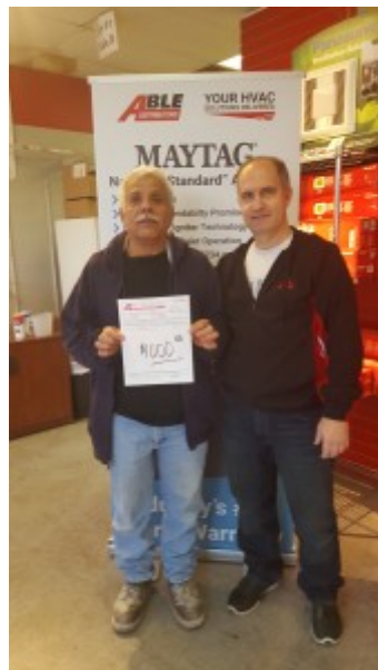
Marco's HVAC - $1,000.00