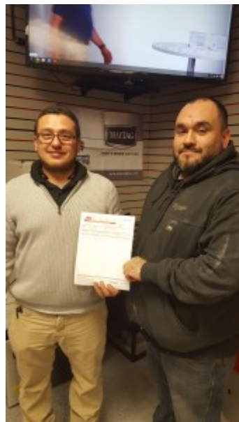
Service Techs HVAC - $800.00