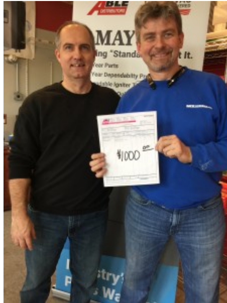
M.Z. Systems - $1,000.00