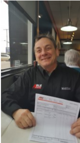
Not So Costly Heating & Air Conditioning - $300.00