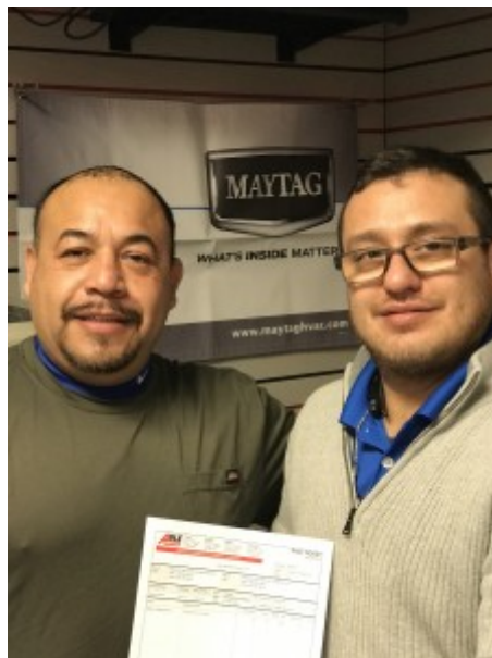
Sergio's Heating & Cooling Service - $300.00